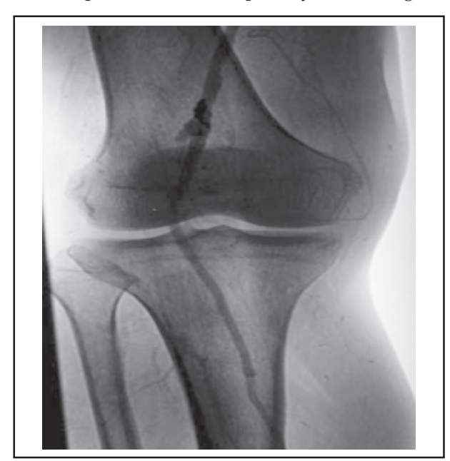
Fig-1: DSA showing open reverse saphenous vein graft between popliteal artery and tibioperoneal truncus.

For all of the 32 patients included in the study, reversed saphenic graft technique was applied. Two patients (6.2%) died during early period. One of these patients died due to cardiac and one due to cerebrovascular events. Eight patients were re-operated at early period due to acute occlusion or bleeding and thrombectomy and re-anastomoses were applied on these patients, as a result patency achieved again.