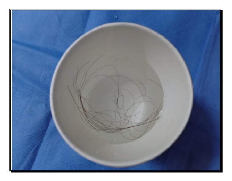
Fig. 2. Porosity test

Sedik et al.; JAMMR, 32(18): 91-97, 2020; Article no.JAMMR.61992