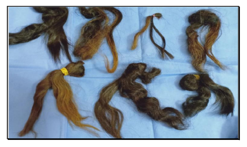
Fig. 1. Some hair tresses after being processed with straightener including straightened and non-straightened samples

Organization, tabulation, presentation and analysis of data were performed by SPSS v25 (IBM Inc., Chicago, IL, USA). Quantitative parametric variables were presented as mean, standard deviation (SD) and range. They were compared by unpaired student's t- test. Qualitative variables were presented as frequency and percentage (%) and were analysed utilizing the Chi-square test or Fisher's exact test when appropriate. P value < 0.05 was considered statistically significant.