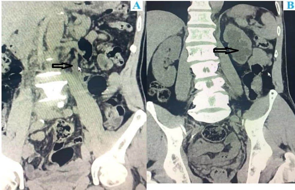
Fig. 1. 1A: CT image showing a mass in the distal one-third of the ureter (black arrow). 1B: CT image showing hydronephrosis (black arrow)

10x7x3cm in dimension. The ureter measured 16.5 cm in length. The lower one-third of the ureter was dilated and cut sections through the ureter showed a friable tan mass in the lumen causing near-complete occlusion with gross infiltration into the muscular wall (Fig. 2 A and B).