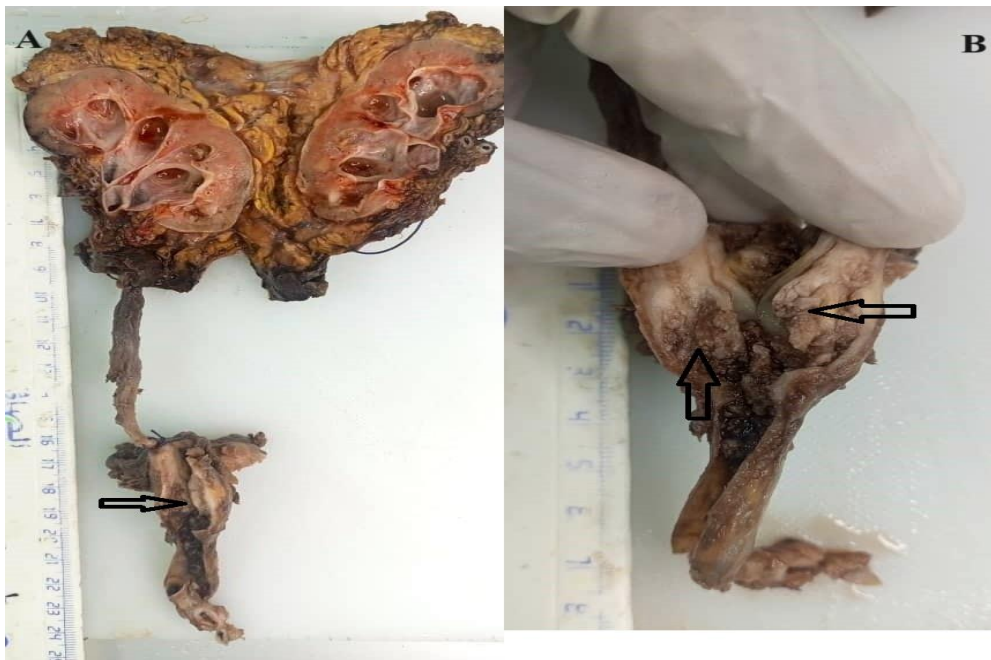
Fig. 2. 2A: Image of gross specimen showing cut surfaces of the left kidney and ureter. There is a tan friable mass in the distal one-third causing lumen (black arrow). 2B: Image of gross specimen showing a closer view of the ureter with tan friable tumour (black arrows)