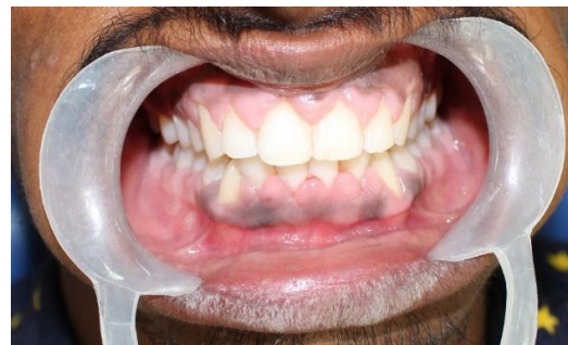
Fig. 3. Reduction in gingival enlargement seen after 1 month follow up, after substitution of phenytoin