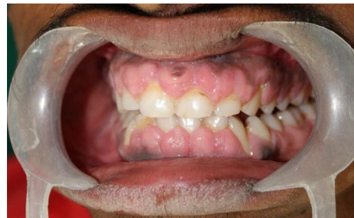
Fig. 2. Intraoral photograph showing enlarged gingiva in maxillary and mandibular anterior teeth region