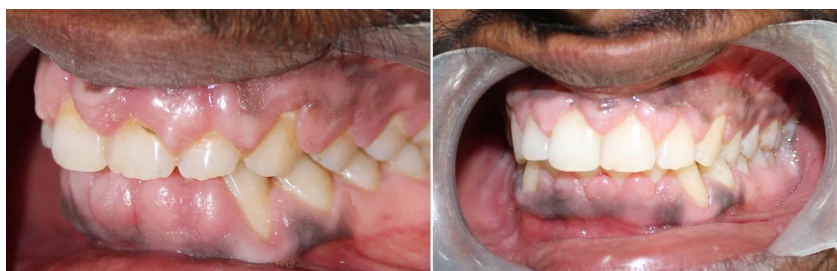
Fig. 4. Intraoral photographs before and 1 month after substitution of phenytoin showing marked reduction in gingival enlargement