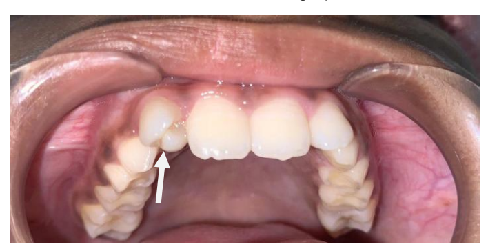
Fig. 1. Tooth morphology; white arrow showing dens evaginatus

An official diagnosis of a nonsyndromic dens evaginatus with two dens invaginatus was made based on the aforementioned clinical and characteristics. Patient radiological explained regarding the presence of no extra tooth in her oral cavity. Mesial and distal pits of the accessory cusp were restored conservatively prophylactic treatment with fluoride application was done. Since, patient did not want any treatment for esthetics, routine clinical and radiographic evaluations were advised.