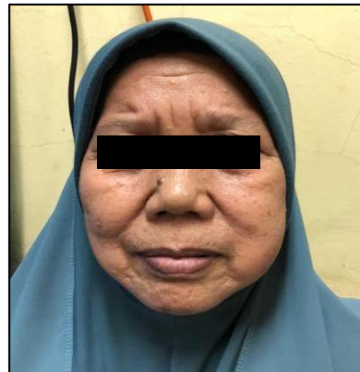
Fig. 1. Image showing swelling over left cheek

Diagnosis of NPC is made by the help of imaging studies and histopathology in addition to nasal endoscopy. Further in this case, nasal endoscopy had limitation in view the mass obstructing the view made difficulty in identifying the origin of the mass. The initial histopathological result from the mass reported as sinonasal undifferentiated carcinoma. The diagnosis of NPC was confirm after CT scan showed mass arising from left side of nasopharynx with involvement of parapharyngeal space and obliterating the left fossa of rosenmuller. The