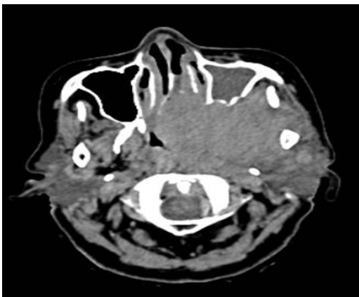
Fig. 4. CT scan revealed mass originate from left nasopharynx