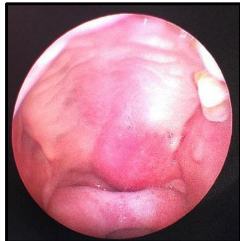
Fig. 2. Swelling over the left palate

“The most challenging differential diagnosis for SNUC include undifferentiated NPC. The cytologic features of undifferentiated NPC is similar to SNUC which are characterized by the presence of single cells, small loose clusters and occasional larger clusters, variably prominent nucleoli, and scant neoplasm. The clinical facts should aid in the differential diagnosis. The separation of these lesions is important because the mainstay of treatment for NPC is radiation therapy (often alone); the prognosis of NPC is much better than that of SNUC, 5-year-survivals around 60%” [7].