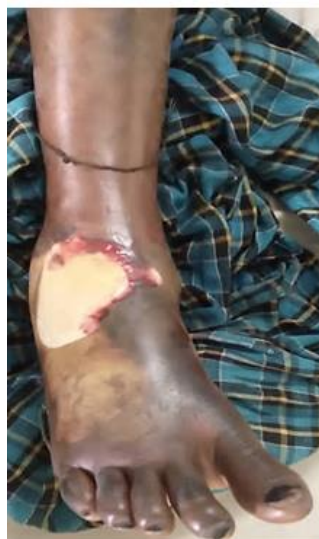
Fig. 4. necrotizing dermohypodermatitis of the leg