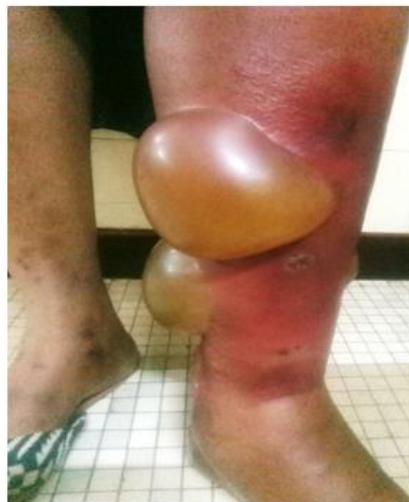
Fig. 3. non-necrotizing dermohypodermatitis of the leg