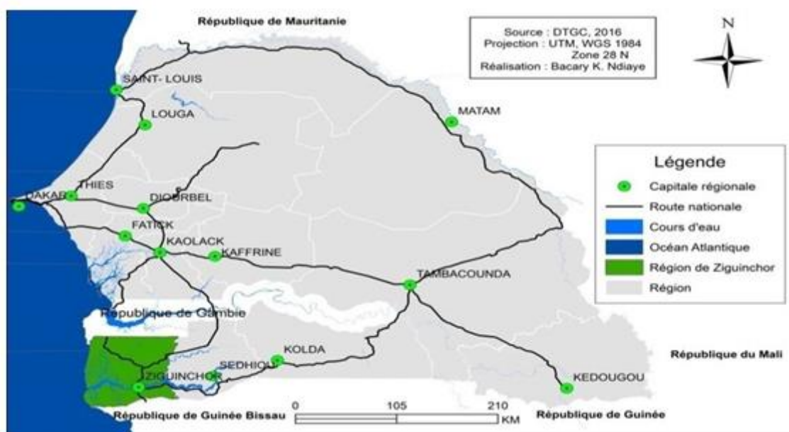
Fig. 1. Map of the Ziguinchor region (Senegal)