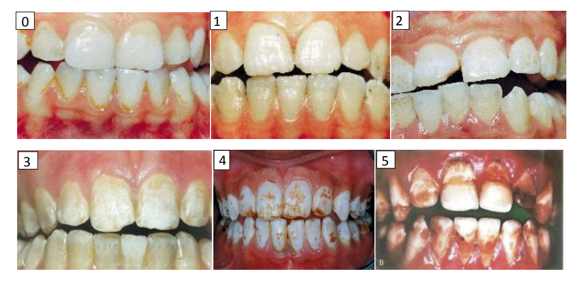
Plate 1. Grades ofenamelfluorosis according to Dean's index criteria (Hattab FN, original) Grades: [0] Normal: The enamel is smooth, glossy, pale milky-whitetransparent surface. [1] Questionable: aberrations from the translucency of normal enamel, with few white flecks or spots. [2] Very mild:Opaque, small paper-white areas involving less than 25% of the labial tooth surface. [3] Mild: Opaque, white areas covering less than 50% of the teeth surfaces. [4] Moderate:Enamel surfaces show marked wear and brown stain is frequently a disfiguring feature. [5] Severe: Enamel surfaces are often hypoplastic with discrete or confluent pitting, intense disfiguring brown stains. Teeth often show a corroded-like appearance.

Dental fluorosis is classifying according to the degree of severity using indices for epidemiologic assessment of the condition. One of the universally accepted indices was developed by Dean in 1942. In Dean's index, each tooth is rating to a score ranging from 0 (normal) to 5 (severe) as depicted in Plate 1. The persons' fluorosis score is based upon the severest form of fluorosis recorded for two or more teeth. The other index (TF) was developed by Thylstrup & Fejerskov (1978) where DF was classified according to the histological enamel changes, ranged from 0 to 9 scores. Very mild to mild fluorosis has no effect on tooth function and may make the tooth enamel more resistant to decay and barely visible. However, the moderate and severe DF is characterized by aesthetically objectionable changes in tooth color with enamel pitting and irregularities.