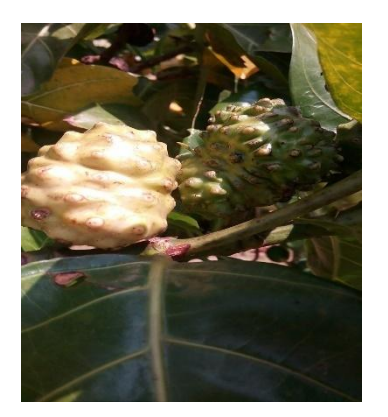
Fig. 3. M.citrifolia ripe and unripe fruits