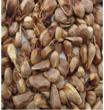
Fig. 4. M.citrifolia seed

have been isolated from the plant so far. Based on the drying process, harvesting method and time, location of cultivation and development and climatic conditions, the variation in their chemistry [17]. polysaccharides, Phenols, anthraquinones, carotenes, lavonoids, steroids moieties are among other and lactone compounds identified from the fruit. Many volatile elements, such as terpenoid aldehydes and ketones [18], have also been isolated from the plant. Some experiments have also extracted fatty acids and esters from the fruit, containing sulphur compounds such as linalool and methanethicol etc. Hexanoic acid and octanoic acids, present in the mature fruits, were isolated from the plant [19]. While lipids are macronutrients, they are present in a much smaller quantity in the fruit. Eicosanoic acid has been isolated from caprylic acid. Higher seeds such as Nonioside A, B, C, D and E were successfully isolated from the plant's seeds. Saturated fatty acids have been identified from the seeds, such as palmitic acid, lauric acid, stearic acid and arachidic acid. Carotenoids and saponins are isolated from roots and fruits, primarily from beta carotene, present in higher concentrations in plant fruits and bark [20].