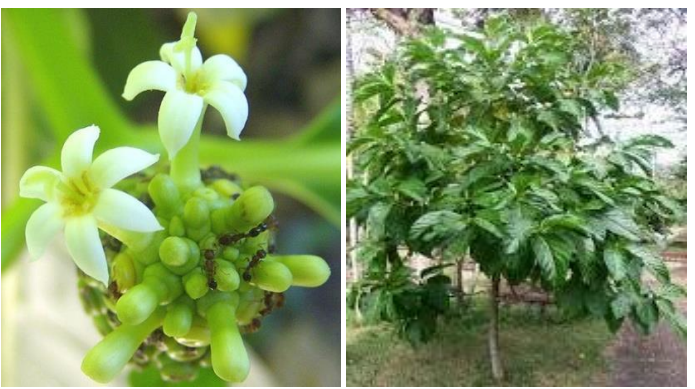
Fig. 1. M.citrifolia plant

Rekha et al.; JPRI, 33(62A): 272-278, 2021; Article no.JPRI.83784